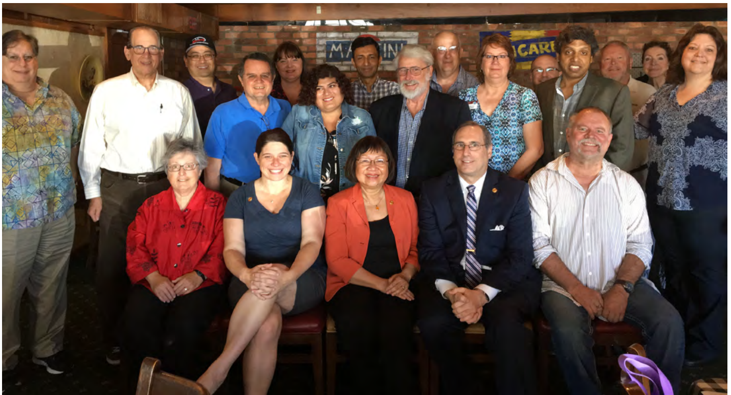
Last District Elected Leader and PRM Meeting, June 4, 2017, Outgoing and Incoming officers

Prepare now for this membership building contest: plan an open house, host a special speaker, or serve refreshments or lunch at your meetings and invite your friends and co-workers.